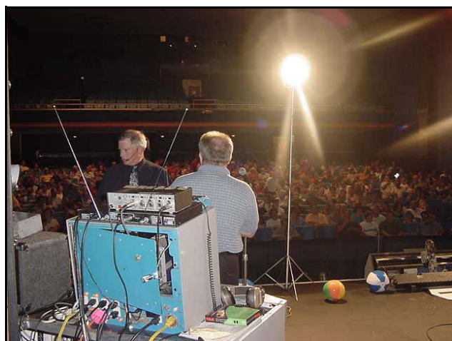
The Victorian theater was an incredible place to present the series to the Norwalk, Ohio community

Little did I realize what battles we were yet to face. I could only assume that Satan was stepping up his interference. No sooner had we arrived than the weather became unbearably humid and in the upper 90's. Much different than what is normal for the area. I was told hurricane Dennis pushed humidity up from the Gulf. Then, the beautiful Victorian Theater downtown had air conditioning mal-functions so the audience would have to tolerate stifling indoor temps during what was expected to be standing room only crowds.