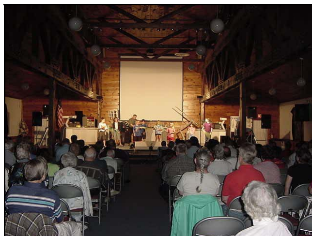
The students enjoyed the “Tube Choir” demo at the Rumney Bible Conference in Rumney, NH.

I was elated! Here was a direct, inside approach, “under the radar,” so to speak, to get several quality creationist DVD's into the hands of one of the world's most prominent scientists. Please pray that Dr. Watson will view the DVD's that his friend sends him and that the Lord may speak to his heart. The Lord truly moves in mysterious ways, His wonders to perform.