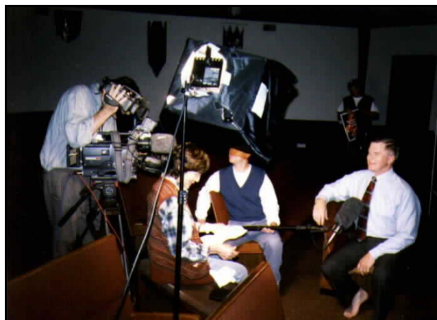
The Lord uses many ways to bring His Word to the world.

Most recently an arrangement for a cameo appearance was concluded with a production team from Columbia Pictures filming a release with actors Tim Allen, Courtney Cox and Chevy Chase. I am to appear in a research lab on one of the