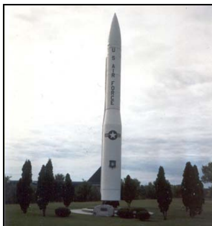
US Air Force Minuteman missile.

The concluding program of the summer series will be held in Mariposa, CA (yikes, another “M”). Grace Community Church has been such a faithful supporter and they have hosted several area-wide outreaches with Wonders of Science in the past.