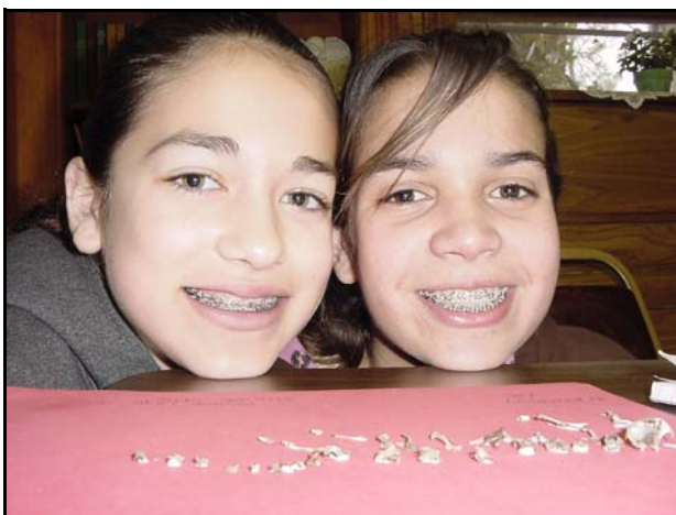
Owl pellets are from indigestible foods (mouse skin, fur and bones) that are balled up and regurgitated. Students pick apart each sterilized ball revealing skulls, jaw bones, ribs, etc., then they reconstruct the skeletons.