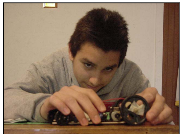
The students make racecars.