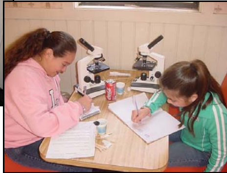
We scraped their cheeks, stained the sample, then observed them under the microscope to see the nucleus (DNA package).

Each grade at our Whittier Christian Schools had a special annual field trip except for the seventh graders.