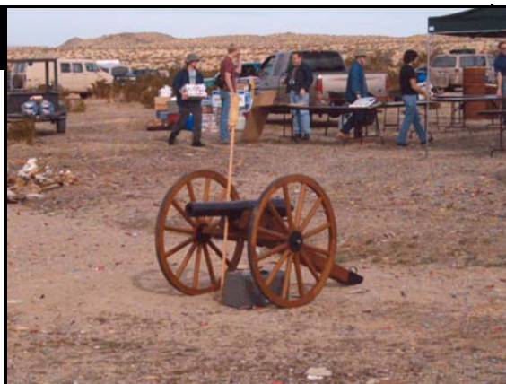
Not many have seen a Civil War type cannon blow up a 55 gallon drum of water!

The non-threatening environment allows for careful, casual conversation before and after the several messages provided by the Whittier Hills Baptist Church team and Wonders of Science. One of the draws is the “guy thing.” Not many have seen a Civil War type cannon blow up a 55 gallon drum of water!