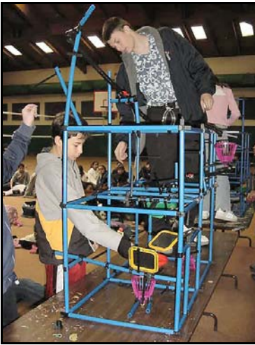
The students build towers to see which marble travels the furthest.

How many of us have ever been sequestered with a hundred 7 th graders for a week? My hat goes off to our teachers and parent chaperones who braved the challenge. The local mountains again provided the perfect setting to direct young hearts and minds toward God and His creation. Throughout the day experiments were offered such as rocket ballistics, crime scene chromatography, racecar design, airplane design, speed challenges and blimp races.”