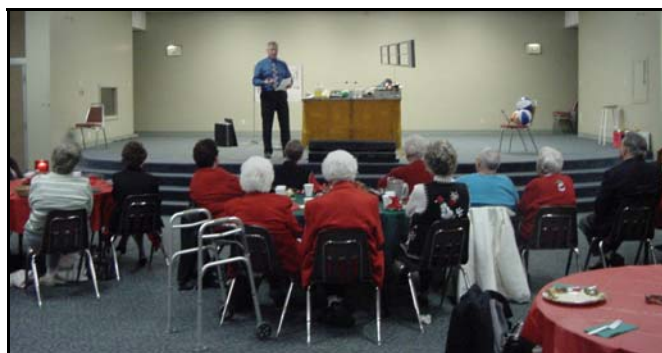
The Lord continues to hold the interest of 80 and 90 year olds!

The collective senior minds present, filled with centuries of life's experiences and learning, could pose a formidable challenge if their mindset was one of skepticism. I continue to be amazed at how the Spirit of the Lord goes before and reaches into hearts, preparing each one for whatever message He wants them to take home. The discussions held afterwards were so pleasant and filled with genuine interest in the deeper things of God.