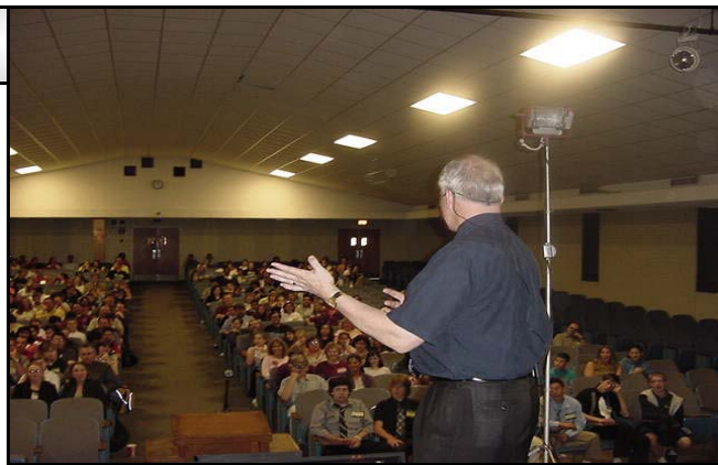
Over 900 science workers are exposed to Wonders of Science as Biola University hosted the ACSI Science Fair.

Association of Christian Schools International (ACSI) it is always such a blessing. The response of the young future scientists to the things of the Lord brought out in our demonstrations is reassuring. The legacy of God's handiwork through His creation can be carried on through these inquisitive minds.