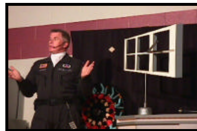
Optical illusions even baffle scientists.