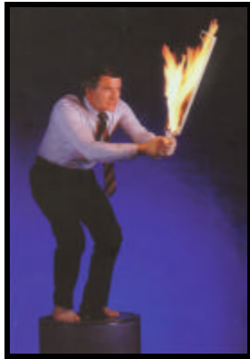
"The Million Volt Ride"

If you answered "all of the above"...you are right! You'll experience all this and more! The "Wonders of Science" program is a dramatic live presentation that demonstrates the power and design of natural law and presents challenging insights into the mind and character of its Creator.