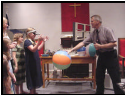
These goggles turn the world upside down.

If you would like to bring the "Wonders of Science" program to your community, contact us today.